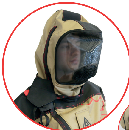
Panoramic screen semi-rigid with ventilation