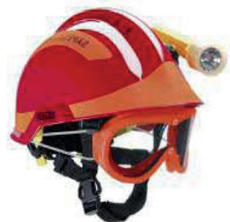
Option: Helmet F2 extrem