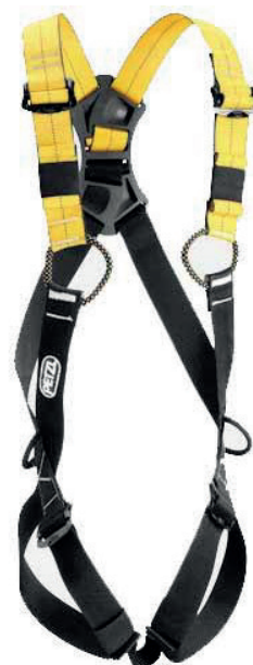
Option: Harness + extension sternal