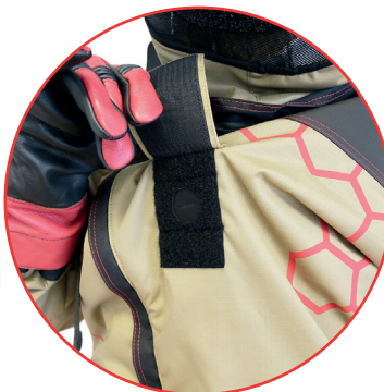
Harness passage fall arrest